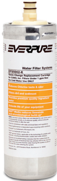
EFS5002-K Replacement Cartridge: EV9751-11

Replacement filter for Cuno® OCS and POU Water Cooler cartridges