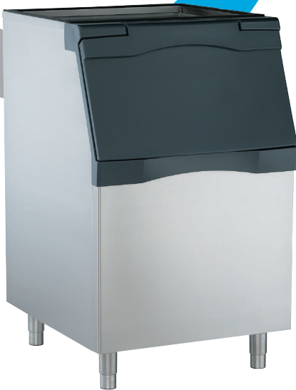
B530S shown with optional KLP8S legs.