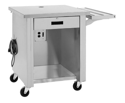
SCS-30 Shown with stainless steel fold-down tray slide and convenience outlet with breaker

SCS-30 30.00" (76cm) deep mobile cashier's counter SCS-36 36.00" (91cm) deep mobile cashier's counter SCS-50 50.00" (127cm) deep mobile cashier's counter