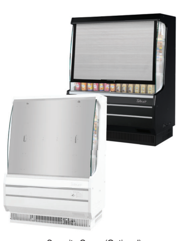
Security Cover (Optional)