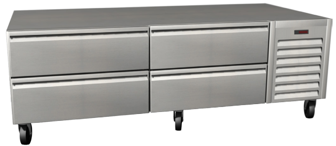
(Model 20072SB with optional casters)

20032SB (32" wide); 20036SB (36" wide); 20048SB (48" wide); 20060SB (60" wide); 20064SB (64" wide); 20072SB (72" wide); 20084SB (84" wide); 20096SB (96" wide); 20108SB (108" wide); 20120SB (120" wide)