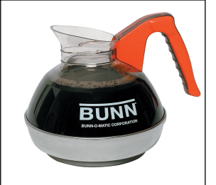
EASY POUR, (ORN) 6/CS