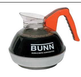
EASY POUR,(ORN) 12/ CS