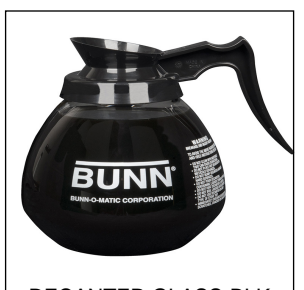
DECANTER,GLASS-BLK 12C 24/CS