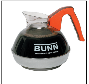
EASY POUR,(ORN) 3/CS