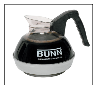
EASY POUR, (BLK) 6/CS