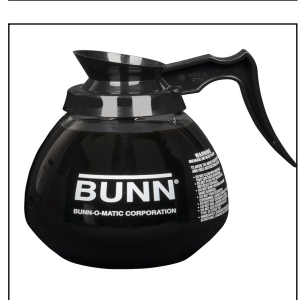
DECANTER,GLASS-BLK 12CUP 1PK