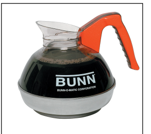
EASY POUR, (ORN) 1/CS