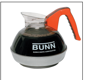
EASY POUR,(ORN) 24/ CS