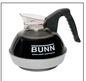
EASY POUR,(BLK) 1/CS