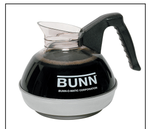
EASY POUR, (BLK) 12/CS