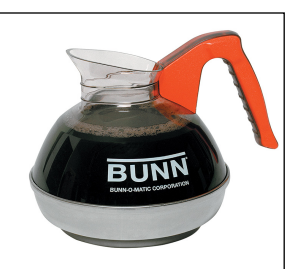
EASY POUR,(ORN) 2/CS