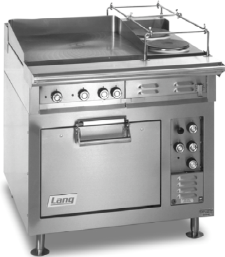
Model R36S-ATAM shown