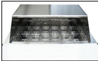
Removable cover with slide back lid

This product is equipped with a fine mesh filter to the front of the condenser to catch dust, and a rotating brush that moves up and down daily to remove excess buildup outward and away.