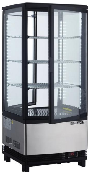
MECR-32D 2 Door Pass Through

4-Sided countertop clear glass door merchandisers are designed for durability and visual appeal in promoting impulse sales of your product. These glass door merchandisers are energy efficient and effective at keeping product at exactly the right temperature. This keeps food fresh & delicious for longer time periods. The simple-to-use but precise digital controls allows for accurate temperature settings and regulation. Unit comes with an internal condensate evaporator so a floor drain connection is not necessary.