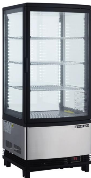
MECR-31D 1 Door

Model: MECR-31D 1 Door MECR-32D 2 Door Pass Through