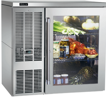
BBS36 with optional glass/w/ stainless steel door shown