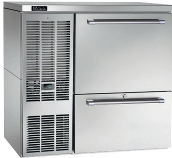
BBS36 with optional wine drawers shown