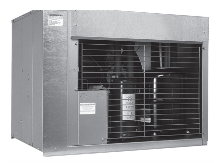
CVDF1400 Condensing Unit