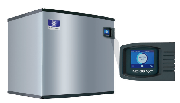
IDF1400C Ice Cube Machine - 115V