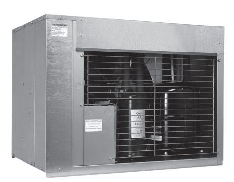
CVD Condensing Unit - 230V