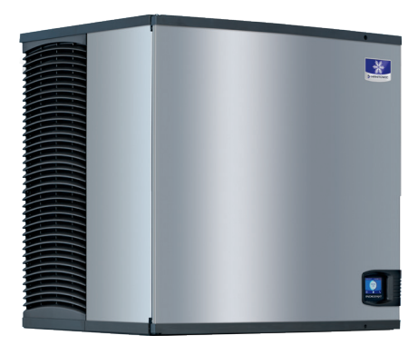
IYF0900C Ice Cube Machine - 115V