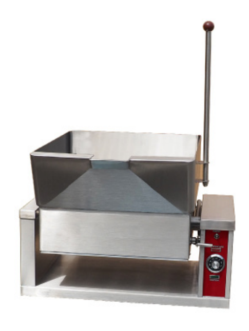
GCTS-16 with optional stand and faucet