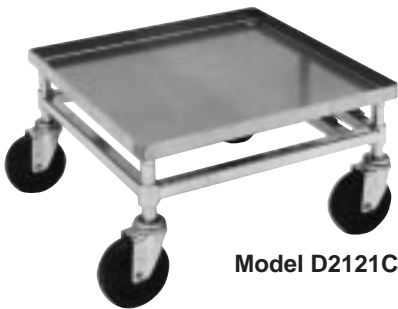
Heavy-Duty Cup/Glass Rack Dollies