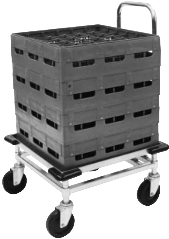
Model CBH2121C (with Sani-Stack Racks)