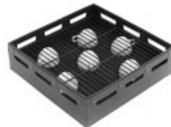
G2020 Grid in full-size rack