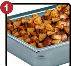
Bulk Food Reheating