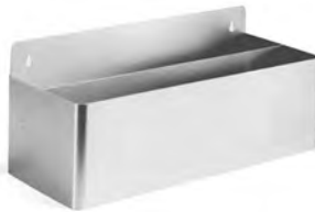
double-tier speed rail