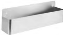
single-tier speed rail