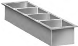
bottle holder tray