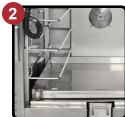
2 Drip Tray