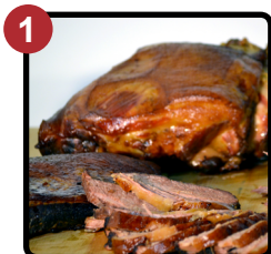
1 Reduce Shrinkage, Natural Browning