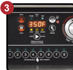
3 Control Panel