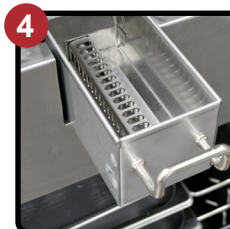
4 Smoke Drawer