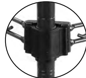
Quad-Adjust® Collar - allows the addition or removable of a shelf without having to disassemble the entire shelf unit.