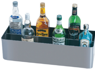
Single Speed Rail S-24 shown