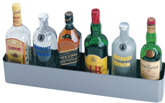
Double Speed Rail D-24 shown