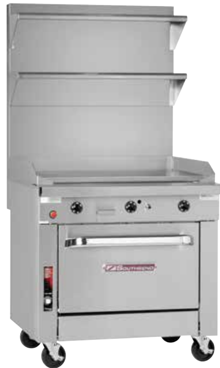
P36D-TTT w/ optional casters and flue riser.

** MANUAL GRIDDLES DO NOT ALLOW SPECIFIC TEMPERATURE OPERATION **