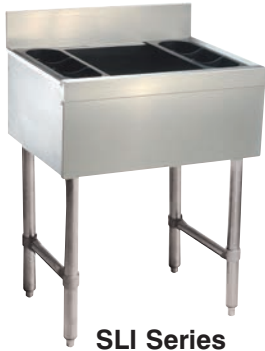
SLI Series 18" Wide Units