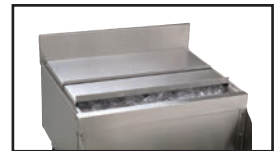
Optional Sliding Stainless Steel Cover Shown