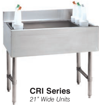
CRI Series 21" Wide Units