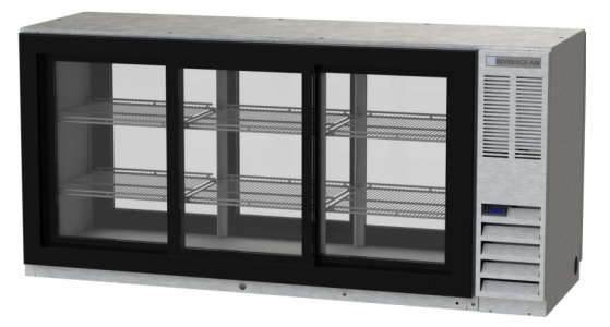
BB72HC-1-GS-F-PT-B (Stainless steel shown)