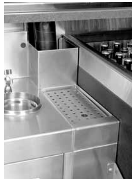
TCA shown in an installation setting