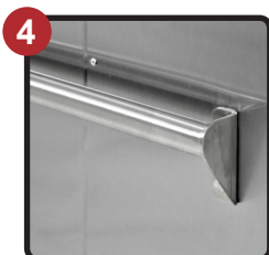
Rear Mounted Stainless Steel Push Bar Handle