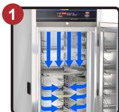
3D AirScreen System