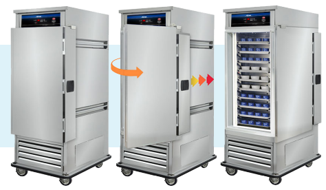
Door Closed Door Open 90° Door Nested

Optional Accessory Sliding Space-Saver Door tucks compactly into side of unit maximizing service space