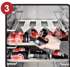
Tilt-Capable Tray Slides