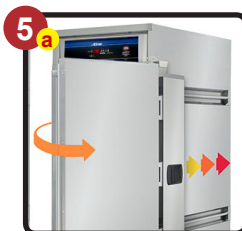
Optional Sliding Space Saving Door