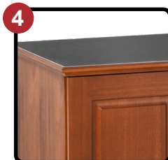
Easy to Clean Surfaces