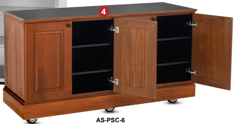
AS-PSC-6 ARCHITECTURAL SERIES (MAHOGANY WOOD)

Shown with Optional Accessory Full Perimeter Bumper