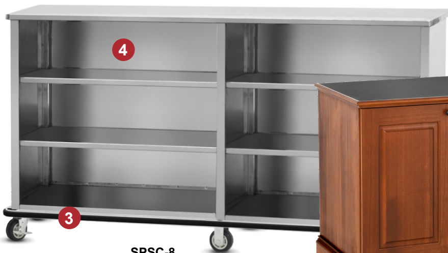
SPSC-8 WEATHER-ALL SERIES (STAINLESS STEEL)

Shown with Optional Accessory Full Perimeter Bumper