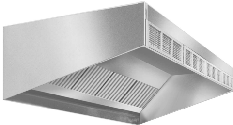
hood with short front fascia—model #HESFA96-66