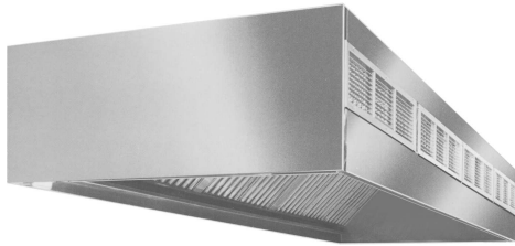
regular hood—model #HEF96-66

Eagle SPEC AIR® (Regular, Short Front) Front Discharge Make-Up Air Ventilation Hood, model _____. All heavy gauge type 430 stainless steel. Constructed per NFPA 96 with all seams welded liquid tight. Make-up air supplied through the hood, independent of ventilation system. Furnished with full length stainless steel grease trough; grease container; UL classified aluminum removable filters; UL vapor-proof incandescent light fixture; 3" airspace at rear, front and rear mounting channels; exhaust and supply collars.