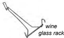
wine glass rack