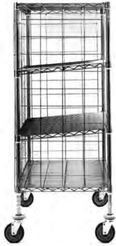
mobile unit with optional slanted shelves

* See charts for complete model numbers.