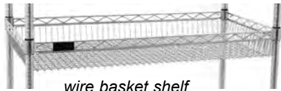
wire basket shelf