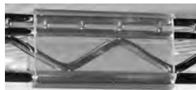
clear plastic label holder for reverse mat shelves