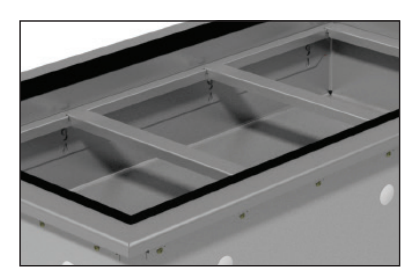
Left To Right Rails & Front To Back Supports Shown Above