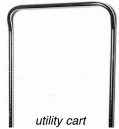
utility cart handle