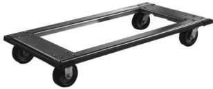
aluminum truck dolly

Includes designated casters and wraparound bumpers. Poly tread.