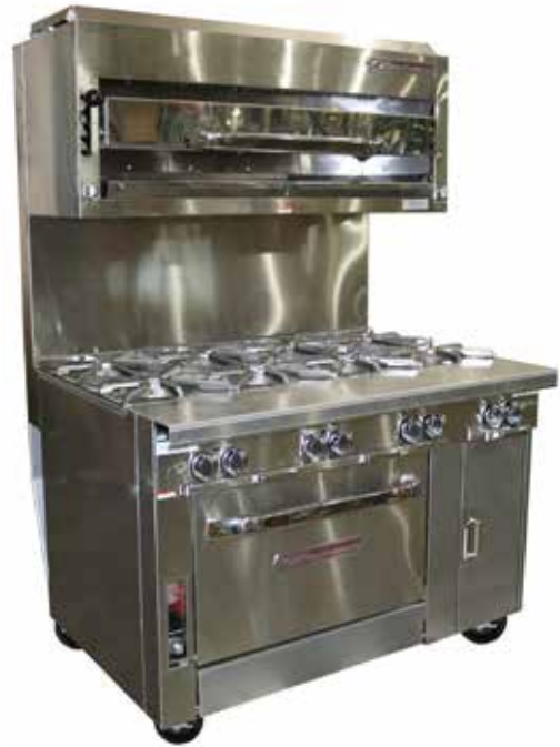
Model P48A-BBBB shown with optional 48" Salamander and casters