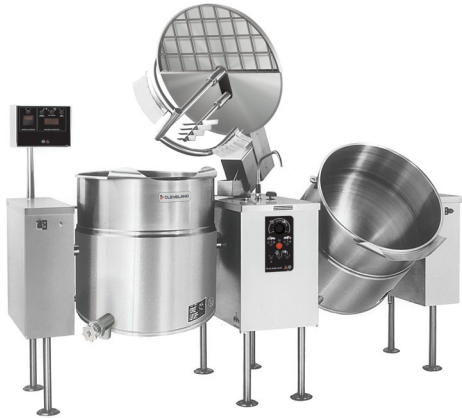
Shown with optional Power Tilt & Product Temperature Control