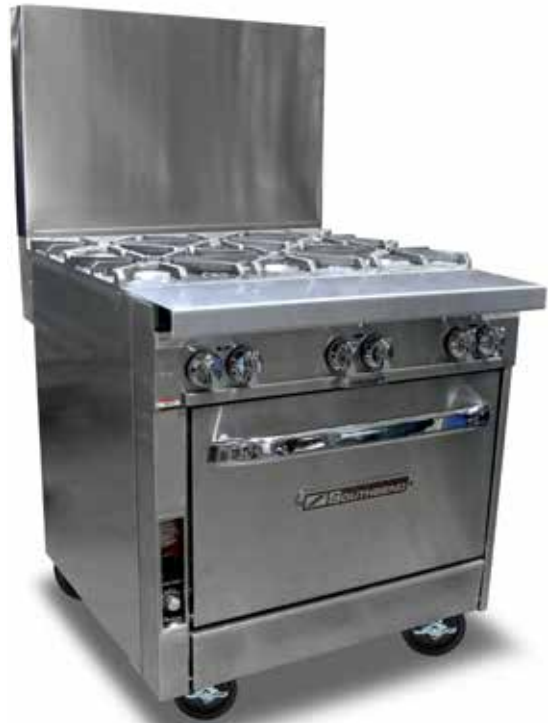
Model P32A-BBB shown with optional 24" flue riser and casters