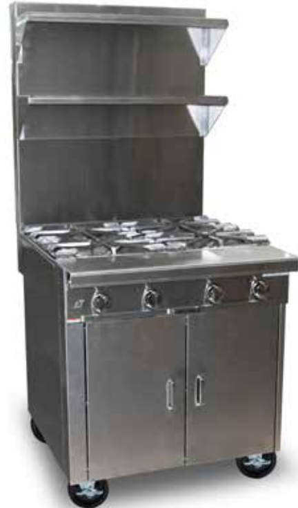
Model P32A-XX with optional 36" flue riser, optional removable cast iron grate tops and optional casters