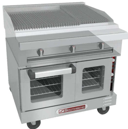
TVES/10SC shown with optional platinum equipment mounted on top and casters