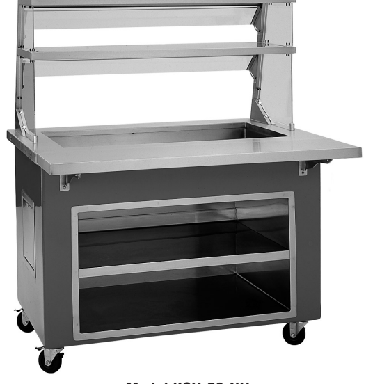
Model KCU-50-NU shown with options E, H & P

*Inclusion of these options will alter the electrical specifications of unit.