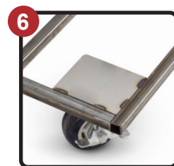
Built for Transport