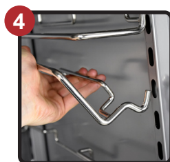
Adjustable Tray Slides