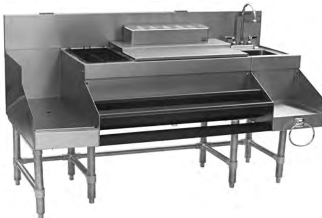
combination cocktail station

Eagle Spec-Bar® Combination Cocktail Station; model _____. Heavy gauge type 304 stainless steel body, legs, leg channels and cross rails. Models offered with (12" or 18") recessed workboard with 1½" drain and stainless steel removable perforated insert, or with (12" or 18") tiered liquor display with ABS for sound deadening—#CCS-72 has both. (36" or 42") combination foamed-in-place insulated ice chest with bottle holders. Two ¾" x 2½" tubing access holes in top of backsplash. Condiment dispenser. 12" single wet waste sink with T&S faucet and perforated lift-out strainer. Stainless steel blender shelf with towel ring and rear cord access hole. Stainless steel double speed rail with ABS for sound deadening, and stainless steel adjustable bullet feet.