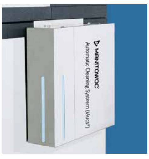
iAuCS for External Mounting