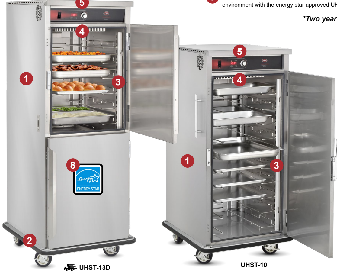
(Shown with Optional Accessory Dutch Doors and Magnetic Work Flow Handles)