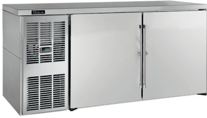
BBSLP60 with stainless steel door shown