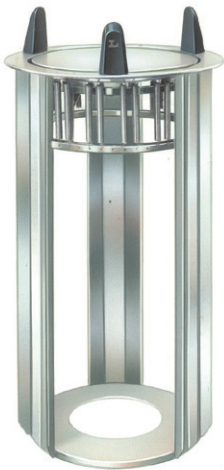
Model 4009 Open