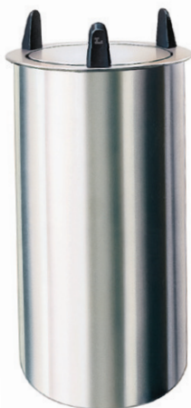
Model 5009 Shielded