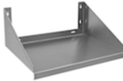
MICROWAVE WALL SHELVING