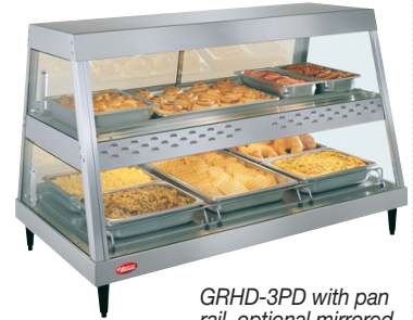
GRHD-3PD with pan rail, optional mirrored glass doors, and accessory food pans