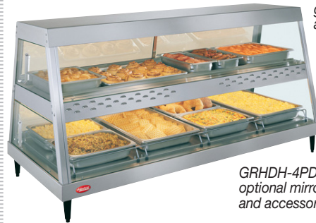
GRHDH-4PD with pan rail, optional mirrored glass doors and accessory food pans