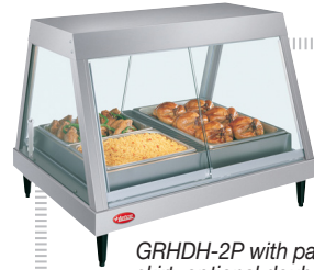
GRHDH-2P with pan skirt, optional double sided opening, and accessory food pans

For operation, location and safety information, please refer to the Installation & Operating Manual.